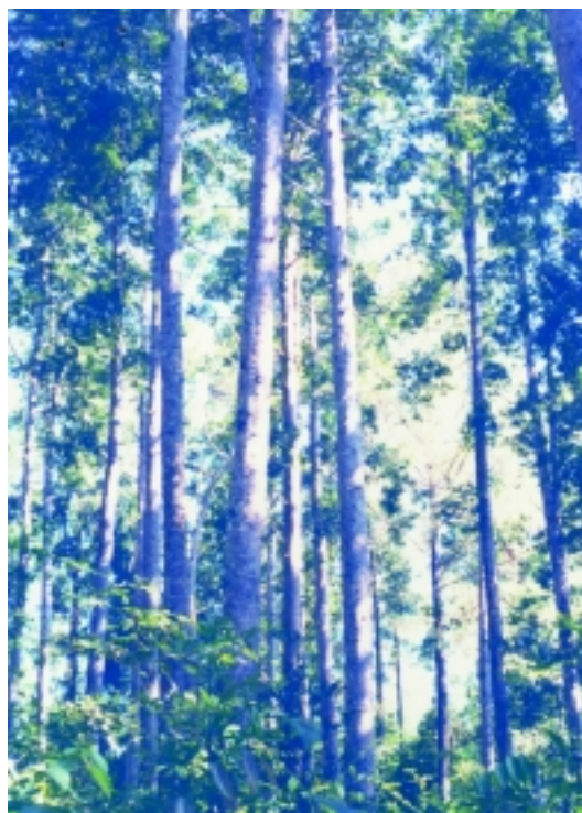
Agathis loranthifolia stand at Gunung Walat, Sukabumi, West Java, Indonesia.