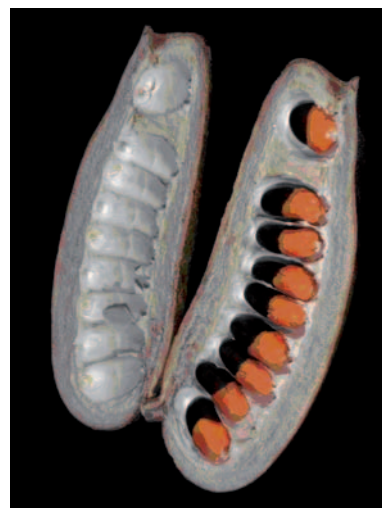
A longitudinal cut of A. africana pod with seed (material provided by CNSF).

The fragrant white flowers often have purple markings. The flowers are composed of 3 elliptic upper petals, 10-12 mm long and 1 lower petal with two divergent round lobes.