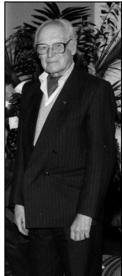
Fig. 1. Dr. honoris causa, University of Tartu, Dec. 1, 1994.