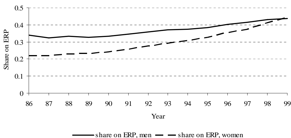
Fig. 1. The share of men and women, 60-66 years of age, on Early-Retirement Pay, 1986-1999. Source: DfA's (Direktoratet for Arbejdsløshedsforsikring) Annual Report , (1999), and Statistics Denmark's, homepage: www.dst.dk .

cent of the earlier wage income, whereas for a textile worker, the benefit amounts to about 83 per cent. 6 After a maximum of 2.5 years on the ERP scheme, the amount of retirement benefit decreases to a maximum 80 per cent of the unemployment benefit (82 per cent after 1993). If an individual is unemployed before joining the ERP, the duration of the maximum payment period is shortened, such that after a maximum 2.5 years on unemployment benefits or on ERP, the amount of retirement benefit decreases.