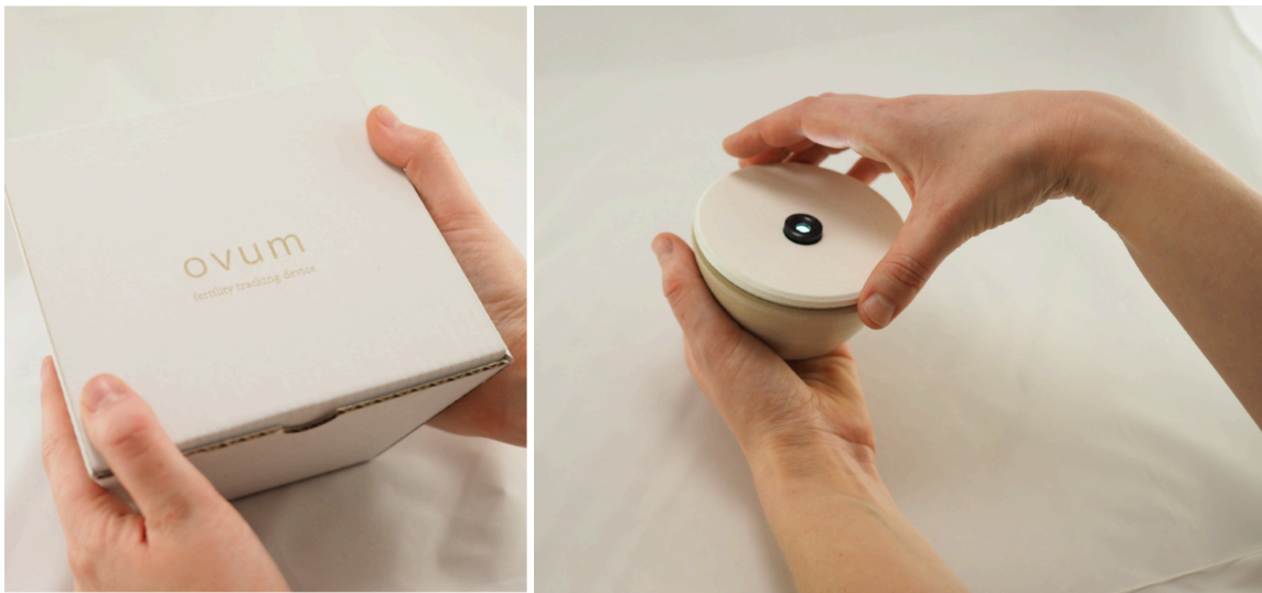
Figure 2: Ovum in its packaging (left), and held (right)

Ovum is a careful ovulation-tracking device for couples seeking to conceive. Detecting and monitoring fertility in the home is complex, knowledge intensive and highly personal [5], which warrants carefulness when designing tracking devices. There are various ways of tracking ovulation: charting the menstrual cycle, testing for the luteinizing hormone in urine, measuring sharp increases in basal body temperature, and tracking an increase of electrolytes in saliva. Existing fertility tracking devices are available for each of these methods, and include smartphone applications to track the menstrual cycle, thermometers to measure basal body temperature, chemical tests for urine, and microscopes to inspect saliva. These devices are typically designed for an individual and represent clinical instruments, even though fertility tracking and sexual intercourse are not medical procedures and involve mostly two people. Further, urine and temperature tracking use binary representations of the body as either fertile or infertile, black-boxing data interpretation and re-enacting the clinician/patient relationship.