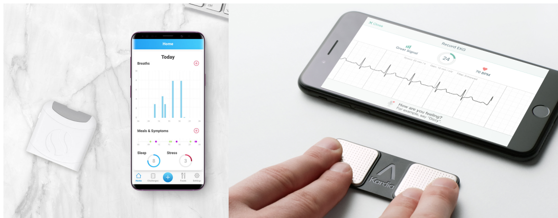
Figure 1: Foodmarble's Aire (left) measures qualities of digestion and informs a user of any potential digestive issues. AliveCor's Kardia Mobile is an EKG monitor for when you need to know your heart's status on the go.

Both trends are rooted in the possibilities that come with cheaper and more widely available sensor technology. We already see some convergence in how domestic healthcare technologies are designed. Current designs are limited in terms of their variety of use (their ability to meet the many different types of users/patients), in their variety of aesthetics (either gray plastic and steel or Apple's sleek take on devices), and in their ability to let data travel from the private sphere to the medical profession regardless of where or how it was initially collected (among private self-tracking technologies, the data is seldom recognized by doctors [12]; in medical devices the data is seldom interpretable by patients). How these technologies and the infrastructures that accompany them are designed going forward will have an extensive impact on larger healthcare systems, and could fundamentally reframe how we understand our bodies and their health.