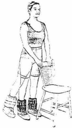
Side hip raise