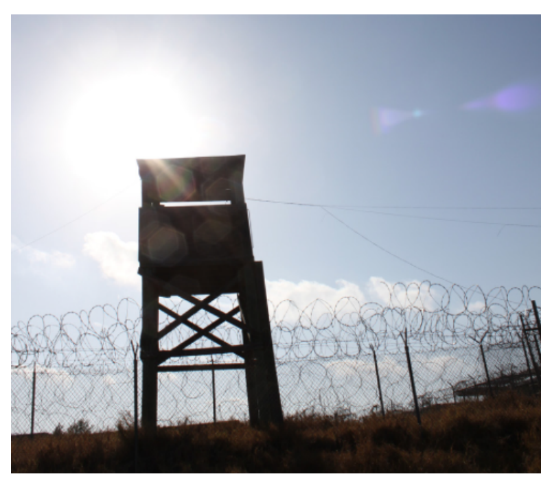
Figure 3:Photograph of Guantánamo Bay detention center from Jordan Scott's Clearance Process

While the media forms mirror each other in the ways that they present absence—especially the absent body—they produce very different affective responses. In viewing the photographs, there is a tension between their aesthetically pleasing quality and our knowledge of the cultural trauma taking place in the spaces they represent. A surveillance tower stands against a brilliant blue sky, as hexagonal bokeh dapple the foreground. Barbed wire fences dissolve into a horizon of white cloud.