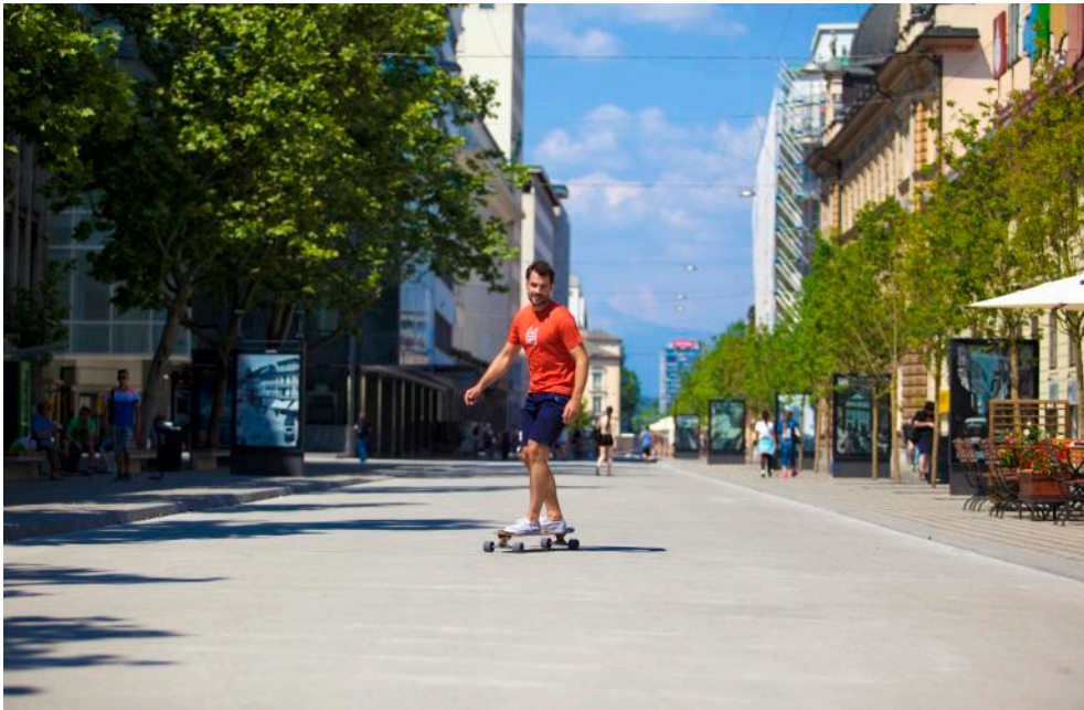
Figure 2. Slovenia Street ( Slovenska cesta ) closed for traffic (photo: Dunja Wedam). Source: [28].