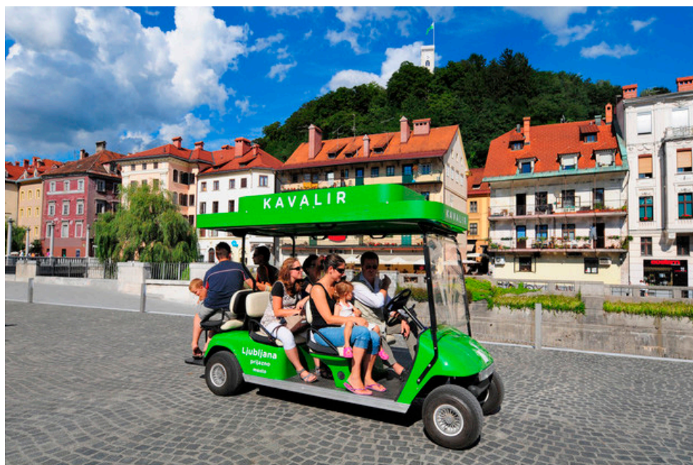
Figure 3. Free Ride with the City Center “Cavalier” (photo: Dunja Wedam). Source: [28].

In addition to reducing traffic, expanding pedestrian areas, and transforming the area along the Ljubljanica River (Figure 4), an important task in revitalizing the city center was expanding the green areas. Today a third of Ljubljana’s total area is green and the city is one of the highest-ranked EU cities for this indicator. In addition to the existing large urban parks, including the oldest, Tivoli Park, and the Trail of Remembrance and Comradeship (a green ring encircling the city), Ljubljana built five new parks before running for the Green Capital Award. These five new parks were built on degraded land (overgrown riverbanks, abandoned industrial areas, etc.), which amounts to an increase of 40 hectares in four years [29]. Therefore, the jury found that: “Progress has been made in preserving and