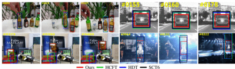
Fig. 2 qualitatively illustrates the performance of our tracker in comparison with three trackers: the CNN-based trackers HCFT and HDT as well as the correlation filter tracker SCT6 [13]. As the results in Fig. 2 indicate, the baseline trackers get easily confused in situations such as scale variation, illumination variation, in-plane and out-of-plane rotations. The proposed particle-correlation filter is able to sample several image patches and it is hence capable of overcoming these difficulties.

We evaluate our tracker on the well known Visual Tracker Benchmark v1.0 [11]. This benchmark contains 50 data sequences that are annotated with 9 attributes representing challenging aspects of tracking, such as scale variation, in-plane rotation and illumination variations. We use a one-pass evaluation (OPE) in which the tracker is initialized with the ground truth location at the first frame of the image sequence [11]. Also, we heuristically set \alpha = 0.8 and N = 300 .