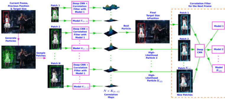
Fig. 1. Overview of our proposed tracker.

where i = 1, \dots, N and N is the number of the particles. In order to limit the number of particles needed, rather than drawing \eta^{(i)} directly from an eight-dimensional distribution, we draw its samples individually, and change its height and width simultaneously using the same sample (i.e., we change the target scale but not its aspect ratio).