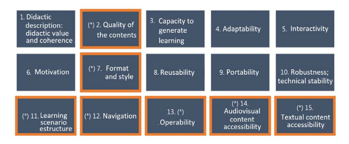
Figure 2. UNE standard quality model. Integration of accessibility requirements

The UNE 71362 standard quality model is made up of fifteen criteria. The first six criteria evaluate didactic quality. Criteria seven to ten evaluate technological quality. Finally, criteria eleven to fifteen describe how to evaluate accessibility. As can be seen in figure 2, criteria 2 (didactic) and 7 (technological) also include accessibility indicators. The following subsections detail each of these accessibility indicators and criteria,