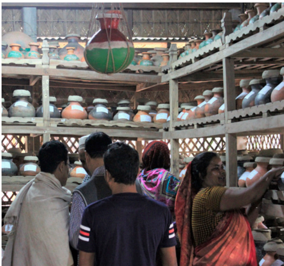
Photo 1: The Tangail Community Seed Wealth Center.

Zilhaj (the twelfth and final month of the Islamic calendar). This festival is marked by the slaughtering of sacrificial animals, including cows, buffaloes, goats and sheep, and a few other animals. According to the Department of Livestock Services (DLS), 4.58 million cows and buffaloes, 7.20 million goats and sheep, and a substantial number of other sacrificial animals were available for slaughter throughout Bangladesh in 2019 1 .