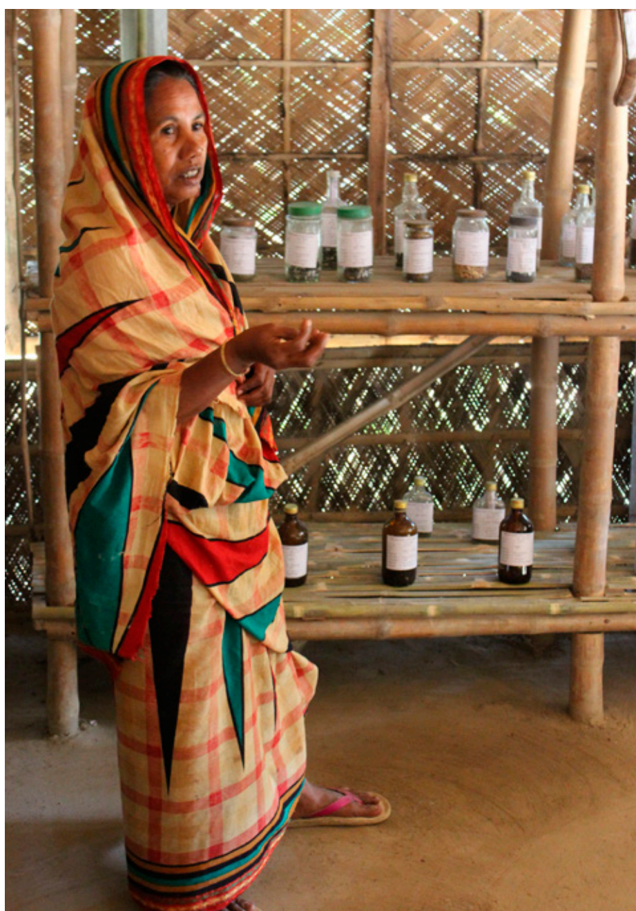
Photo 11: Seed huts maintain crop diversity at community level.