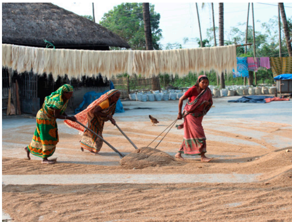
Photo 12: Drying rice in the open air.