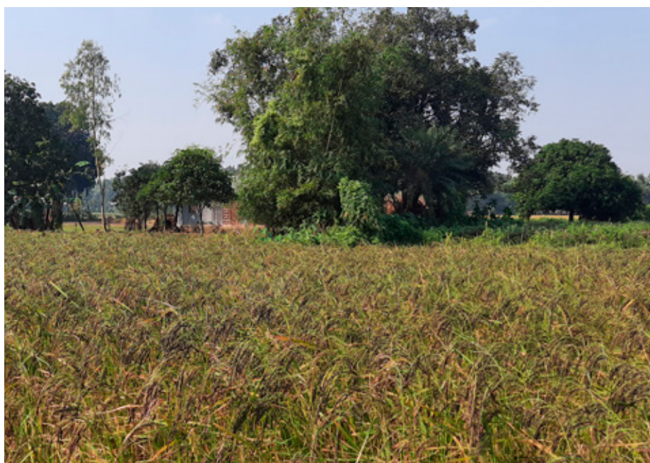
Photo 8: Kalobakri rice in the field.

Khichuri is rice cooked with pulses/lentils, vegetables, turmeric and spices (photo 7). Fifteen rice varieties used to make this dish include: Ajoldigha, Bashmoti, Bhawailya digha, BRR1-28, BRR1-29, Chamara, Dholdigha, Hidi, Hijol digha, Kalobakri (photo 8), Kartikjhul, Matibhangor, Pakri, Pati shail and Patjag.