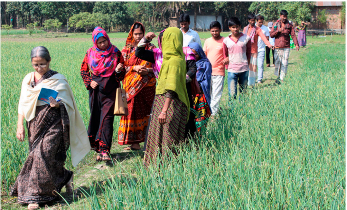
Photo 9: UBINIG staff visits the fields of seed hut members to assess crop diversity.