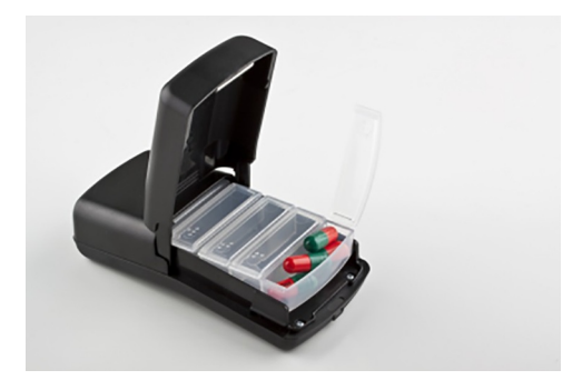
Fig. 1. The Wisepill device.

The proposed intervention is composed of electronic device that monitors how patients take their medication, and sends SMS reminders to patients to help them take their medications, as well as sending SMS