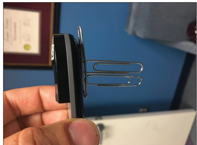
Figure 1: Vocera badge holding three paper clips

Medtronic Inc., the manufacturer of Strata™ valves, reports that 80 G directly adjacent to the valve is necessary for any adjustment to occur. [5] They state that if something has the ability to lift three paper clips, it creates a strong enough magnetic field leading to adjustment (personal