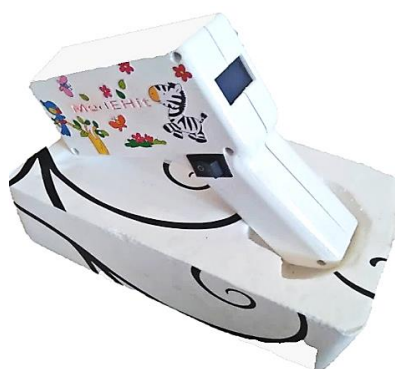
Figure 2 Final product of BiliDice device.