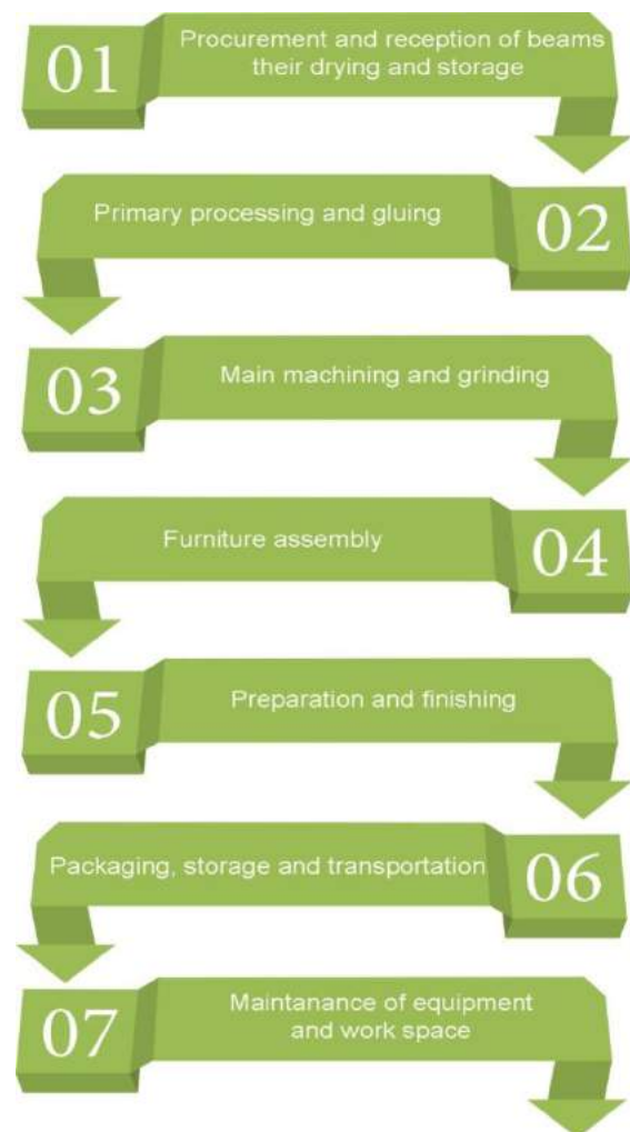
Figure 1. Operations that cover the process of producing wood furniture

The furniture manufacturing industry has been revolutionized over the past several decades. Today, most commercial and production furniture is created by large machinery, much of it automated and controlled by computer. The prevalence of high-tech machinery increases the accuracy and speed of manufacture, but also removes much of the craftsmanship involved. When used well, and with high-quality materials, machines can make solid and attractive furniture. (Jagg Xaxx, Technology Used in Manufacturing Furniture, attached 27 th of April, 2019 on www.ehow.com )