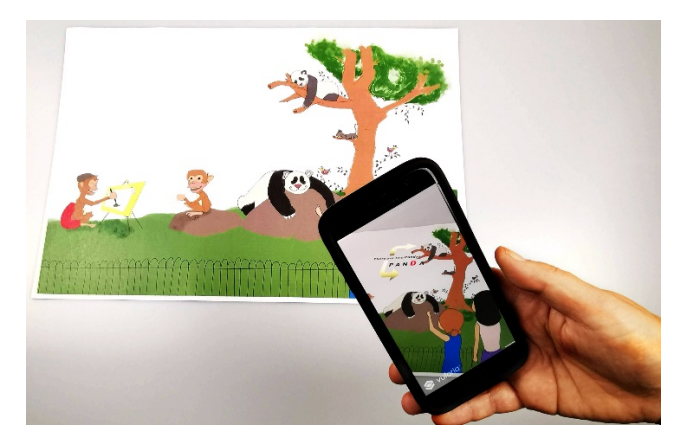
Fig. 2. User interacting with the enhanced book via AR app (Level 2 animation)

Further details of design thinking for our AR-enhancement is discussed in [9]. An interaction of the app with the book spread (engaging with level 2) is shown in Figure 2.