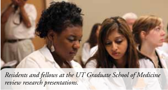
Residents and fellows at the UT Graduate School of Medicine review research presentations.

More than 40 residents and fellows presented abstracts during Research Days that summarized research in both case studies and original projects. Topics included blood transfusion in trauma; dental infection and correlation to systemic illness; improving resident-patient communication; MRSA infections in the head and neck; gene therapy and others.