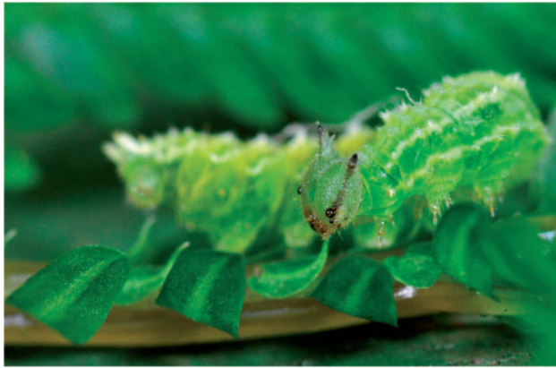
Fig. 1. E. westwoodi larva feeding on S. eurynota at the La Tirimbina Biological Reserve.

2009). It is intriguing that Euptychia would make the apparent switch to Selaginella and mosses considering these plants typically grow in nutrient poor soils and are thought to have less nutrient content relative to the more derived plant graminoids (Scriber and Slansky 1981, Egorov 2007).