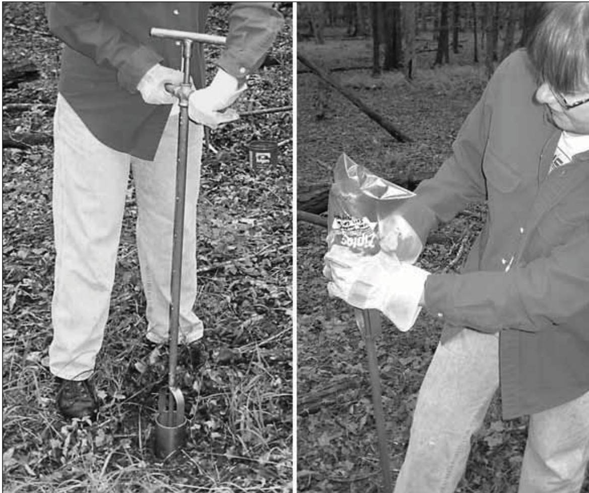
Figure 1—Using the single root auger to collect soil charcoal in Great Smoky Mountains National Park. The photo on the right shows the extrusion of a 10-cm core increment into a labeled plastic bag.

Note: The authors have corrected a typo on page 107 in this pdf. The original publication incorrectly reported the calibrated age range adjusted for the maximum estimated inbuilt age. The range should be 610–370 cal yr BP, as here.