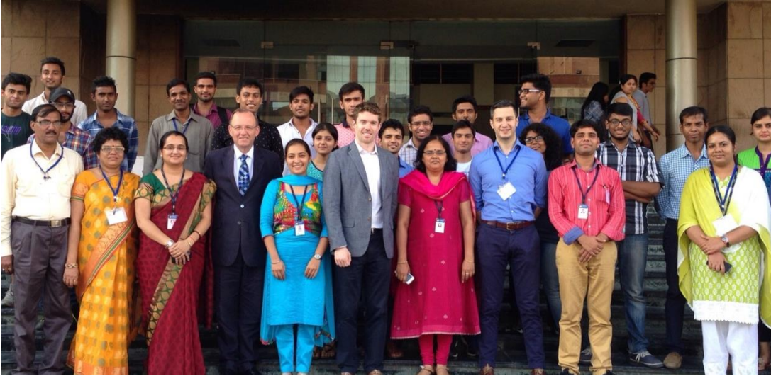
Figure 2. Delegates and participants in the second week of the PDC held from August 24-28, 2015, at Amity University in Uttar Pradesh, India.