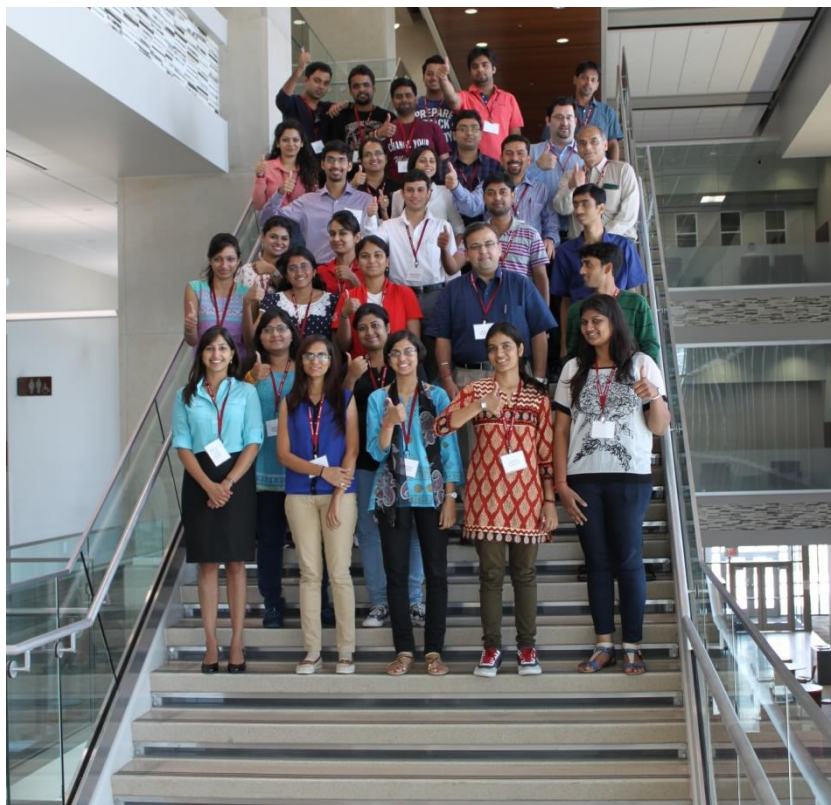
Figure 6. Faculty and students of AINST at Texas A&M University along with participants from eight other Indian institutes/universities for NSTS-2015