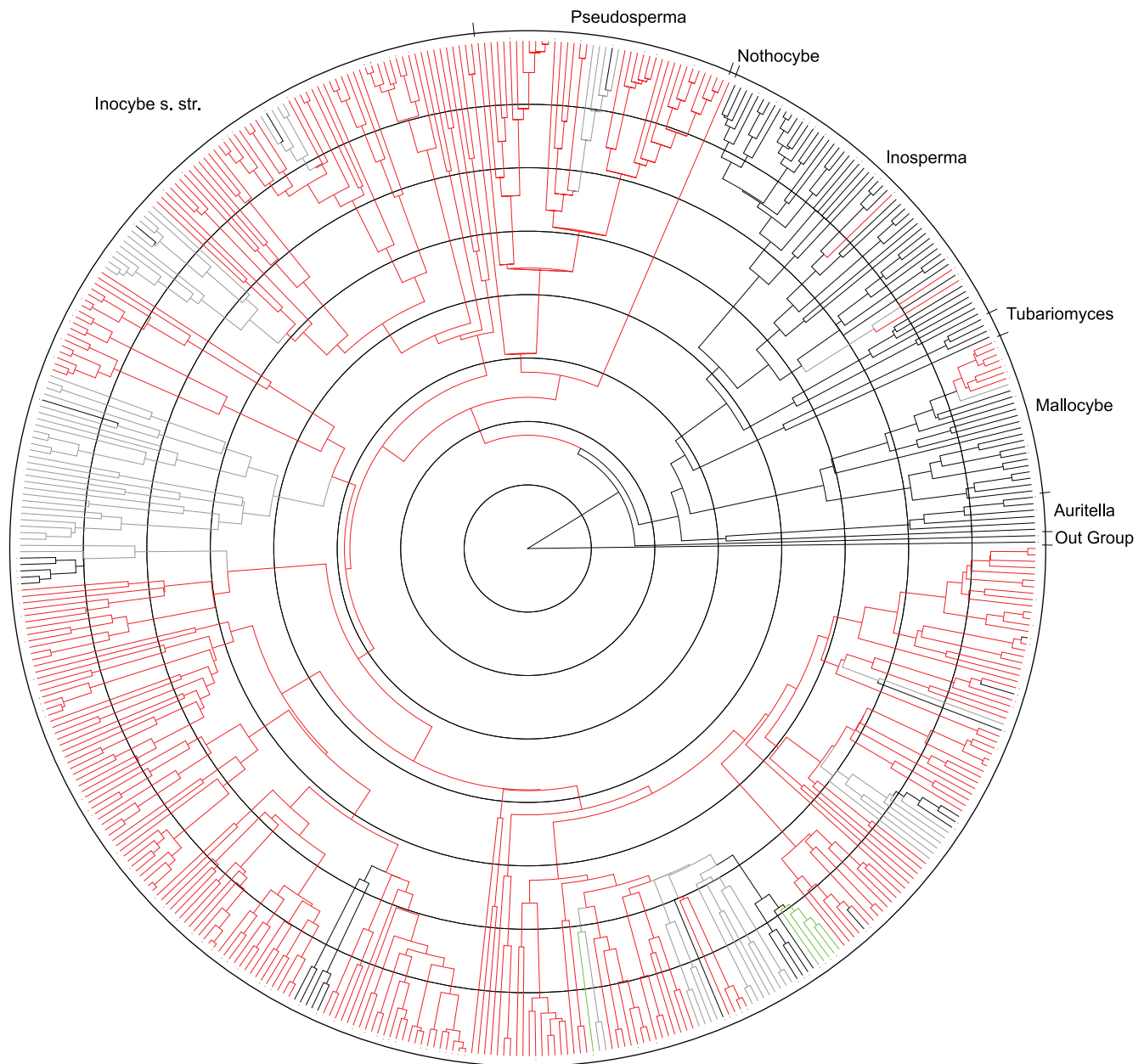
Figure 2. Phylogeny of the Inocybaceae and ancestral state reconstruction of the evolution of muscarine and psilocybin; red indicates the presence of muscarine, green indicates the presence of psilocybin, gray is ambiguous for muscarine, and black indicates the lack of muscarine and lack of psilocybin. Circles indicate time intervals of 10 million years. Dots next to tips indicate species that have been assayed for either muscarine or psilocybin. Major clades of Inocybaceae following [32] are labeled. doi:10.1371/journal.pone.0064646.g002

letic is not significantly worse than the unconstrained tree ( p > 0.05 ). Given the conserved nature of the SH-test [52], we also filtered the proportion of trees in which psilocybin-containing (and muscarine-containing) taxa were monophyletic. None of the trees sampled in the posterior distribution were consistent with these taxonomic constraints. Thus, the posterior odds strongly reject the monophyly of groups containing muscarine or psilocybin.