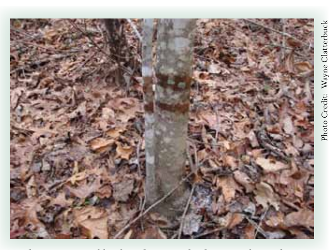
A thin stream of herbicide is applied to a red maple stem as a basal bark treatment.

The advantage of these treatments is that they deliver herbicide directly to the target tree with little chance of the non-target trees being affected. Applications are usually made during the later part of the winter, February and March, when leaves do