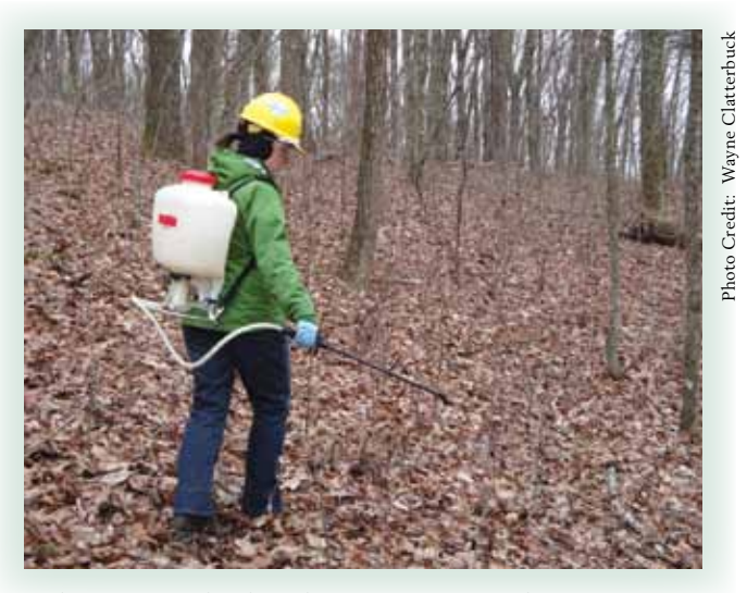
When using a backpack sprayer, Personal Protective Equipment (PPE) is necessary for safely applying herbicide.

foliage. Direct spray can harm adjacent desirable species through poor directional spraying, volatilization, drift from wind, drip from overspraying target plants and poor timing. Timing of application is at full leaf emergence in the summer through the growing season when leaves begin to senesce near the end of the growing season (early September), reducing the effectiveness of the foliar spray. The general recommendation is not to use direct foliar spraying because of the chance of affecting desirable plants.