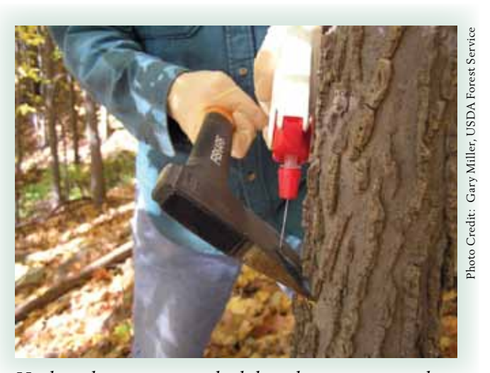
Hack-and-squirt is a method that places a measured amount of herbicide into trees through frills or small incisions in the bark.

Tree injectors, "hypo-hatchets" (Hypo-Hatchet® tree injector) and hack-and-squirt are all tools for application of herbicide into the tree through a cut surface. Tree injectors and hypo-hatchets have fallen into disfavor because they are difficult to use and maintain. Hack-and-squirt is simple and easy because it only uses a hatchet and a squirt bottle (or backpack sprayer) that are easily carried in the