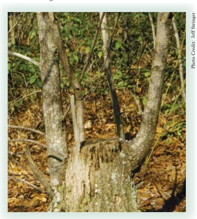
Sprouts originating high on the stump are structurally weak. Trees should be cut as close to the ground as possible to induce sprouting near the ground level.

Almost all hardwood species reproduce from sprouting. The intact root system gives stems produced from sprouting a growth advantage over those that originate from seed. The residual trees should be cut close to the ground to induce sprouting from the ground level. Sprouts originating aboveground on the stump are structurally weak and will usually break with age or be deformed.