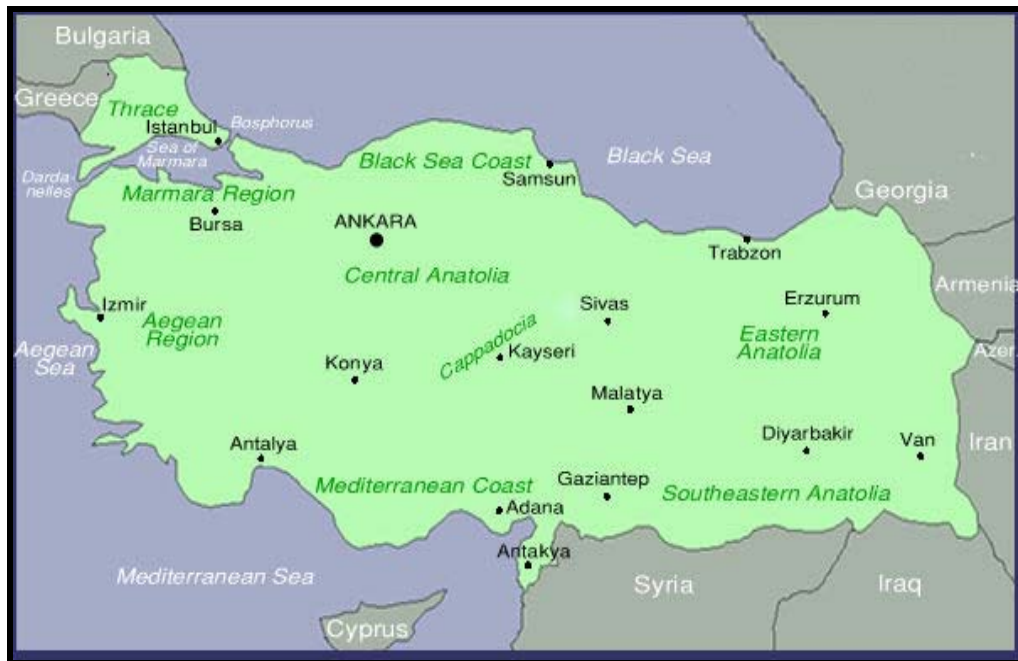
Figure A-1: Geographical location of modern Turkey