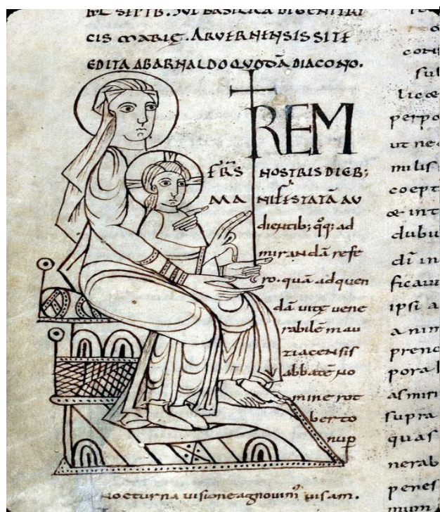
Figure 2. Clermont, BM MS 145, f. 130v

the statue as “Majestatem Sancte Marie I, vestita cum ciborio cum uno cristallo.” 264 Stephen II also rebuilt the cathedral and rededicated it to the Virgin in 946, and one can assume that the statue provided a focus to the devotional and liturgical scheme on the new church. 265 A contemporary text reflects the grandeur of the statue and its effect on its viewers, in an apocalyptic vision by Abbot Robert of Mozat, as recorded by the deacon Arnaud of Clermont sometime shortly after 984. 266 It also provides pictures of the Virgin, both of her majesty statue at the beginning of the Vision, and of the Virgin herself at the beginning of the manuscript: