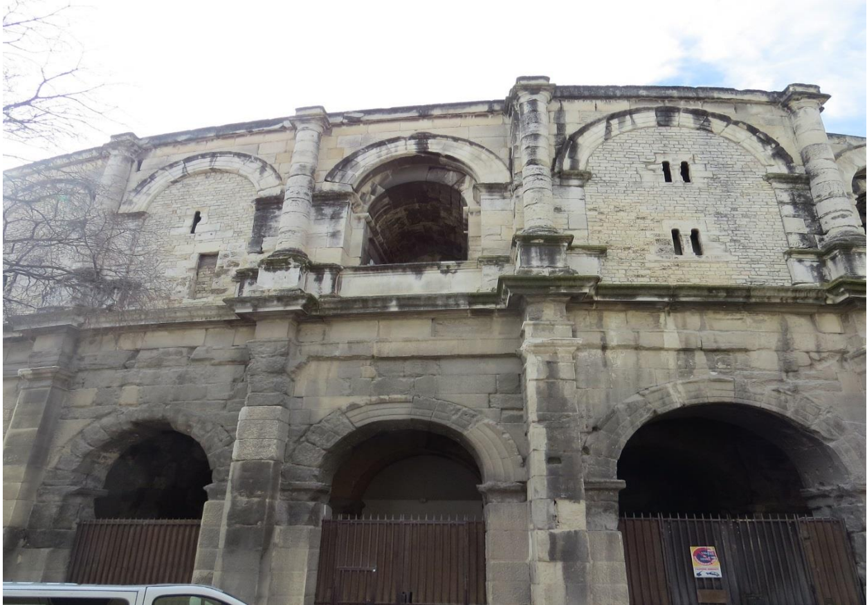
Figure 1. The Arena in Nîmes

identically to the palace of the counts of Toulouse in that city, the Augustan gate-complex on the road leading towards Arles also became a fortified aristocratic palace. 119