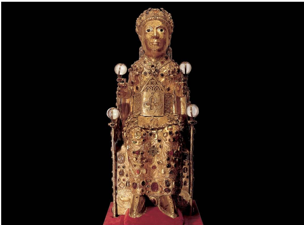
Figure 4. Majesty of Saint Foy 288

commenting only on the “marvelous workmanship,” and that it was “made a great display of gleaming red gold and scintillating germs,” with the relics sealed beneath it. 287 What it was, however, was a Majesty statue: