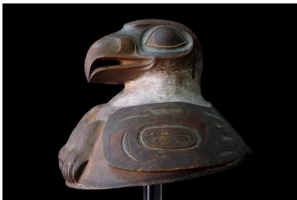
Tlingit War Helmet 25

Museums also engage in collaborative efforts with source communities through the auspices of NAGPRA, or the Native American Graves and Repatriation Act. NAGPRA, a federal law passed in 1990, provides a process for museums and Federal agencies to return certain Native American cultural items, such as the Tlingit war helmet, back their source communities. The act protects human remains, funerary objects, sacred objects, and objects of cultural patrimony and its jurisdiction works to return the objects to “lineal descendants, and culturally affiliated Indian tribes and Native Hawaiian organizations.” 26 One important effect of the process of removing either vague or incorrect identifiers is the reintroduction of Indigenous communities to their ancestral objects, possessions lost via the looting of their villages by explorers and the American military as recently as the early twentieth century. These artifacts, in many cases, are repatriated back to the communities from which they originate, creating a powerful form of closure and retribution for healing some of the pain of colonialism. Researching objects that have been vaguely identified with broad terms or mis-identified, and working with source communities in the process, is again, just the beginning of this healing process that means more to Indigenous communities than having objects returned.