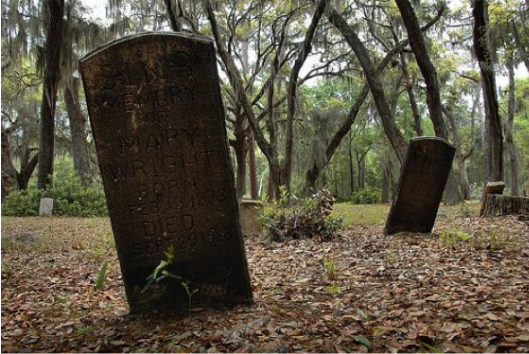
Figure 1. Behavior Cemetery, Sapelo Island, Georgia