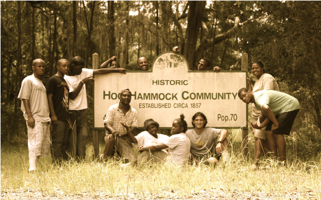
Figure 2. Various Grady Campers, Community Players, and Teacher-Student