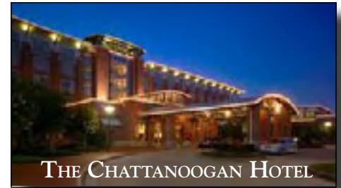
THE CHATTANOOGAN HOTEL