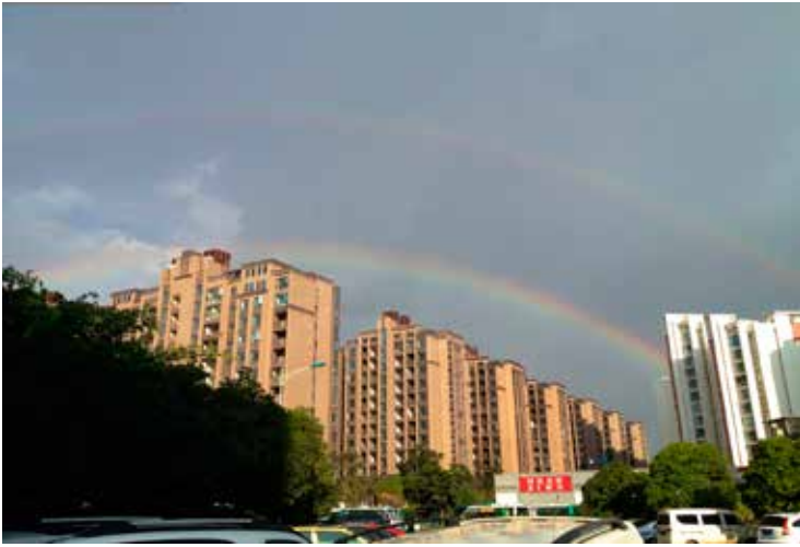
The sun returns to Kunming, China

to work with kids who have those same challenges. I ‘get’ them and feel certain that this fact means a lot to my students.”