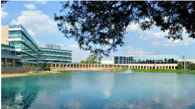
Scripps Networks Interactive Headquarters

(JR) I do not interact with public, although what I create is in a large part for them. We use local cataloging schema, not a specific metadata schema but one that has been created as needed over the years. I rarely see a book in my job. In my previous position, I worked with many physical objects: tapes of shows, preparing them and cataloging them before they were ingested into the systems for quality control and airing. I also took part in quality control of non-linear video assets and created a technical manual for part of that process.