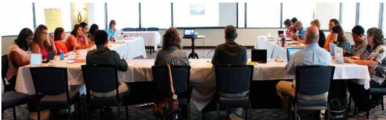
2014 SIS Faculty/Staff Retreat