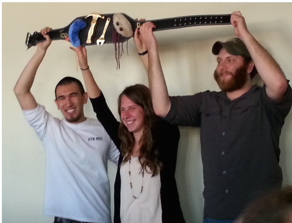
The Decepticons team holds up the victorious WWE title belt after winning the “Build-a-Microbe” competition. .