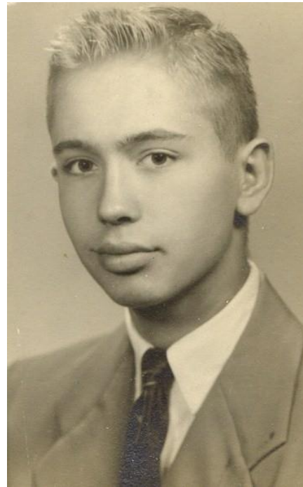
Age 17 High School Graduation Photo