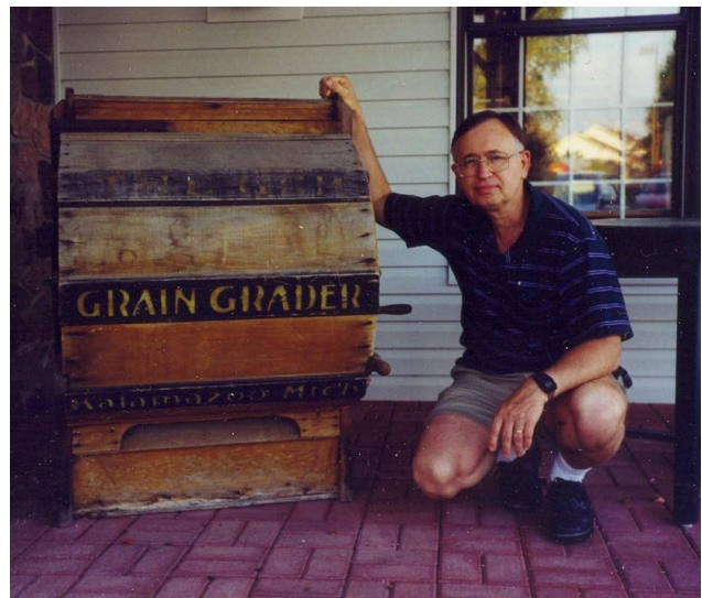
Age 59 (in a museum)