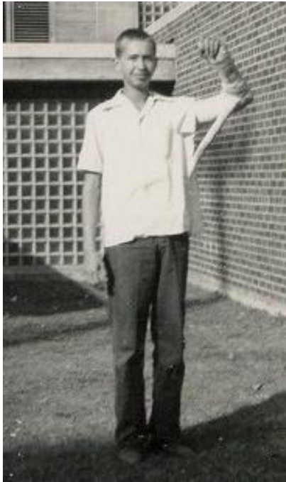
Age 14 A Football Injury