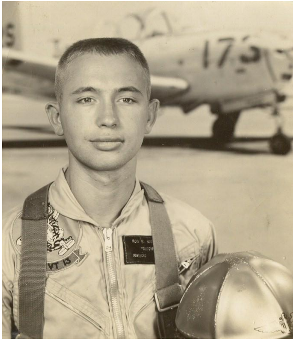
Age 23 Serving two years in the Navy Reserves after two years of college and two years of working