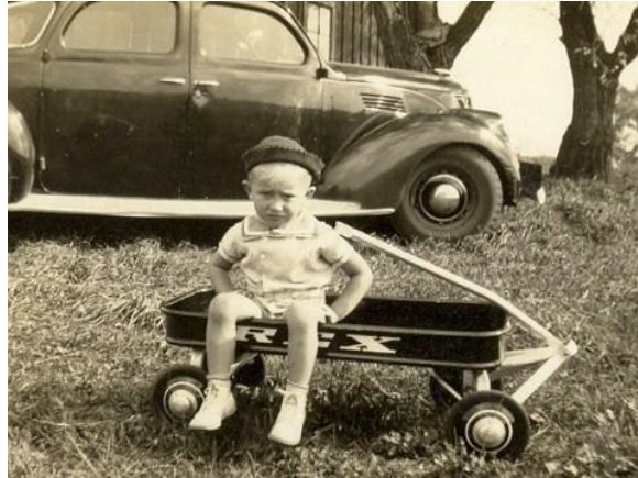
Three years old