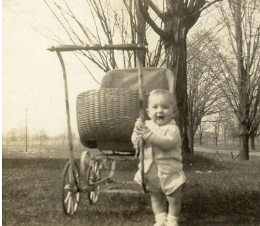
Six months of age