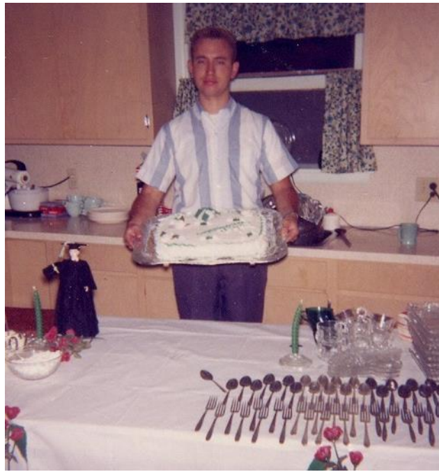
Age 26 - Party after graduating with a B.S. in Agricultural Economics from Michigan State University