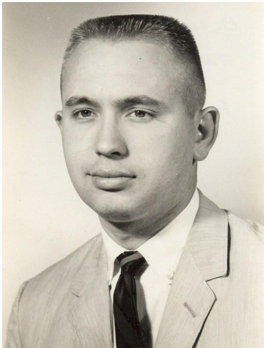
Age 26 – Starting first professional job as a Cooperative Extension Agent in Mason City, Iowa