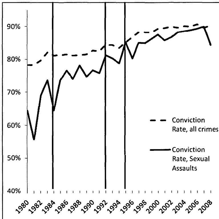
Figure 2. Conviction Rates of Federal Sexual Offenders. The vertical lines represent the passage of the Federal Sentencing Guidelines (1984), the introduction of DNA evidence in federal courts (1992), and the passage of Federal Rules of Evidence 413, 414, and 415 (1995).

the year in which the new rules went into effect, the rate of convictions for sexual assaults was actually higher than the rate for conviction on all federal crimes. This statistic immediately calls into question one of the premises behind Federal Rules of Evidence 413, 414, and 415—that convictions were difficult to obtain in sexual assault cases.