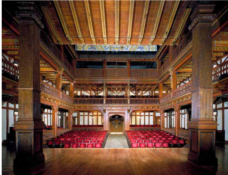
Elizabethan Theatre