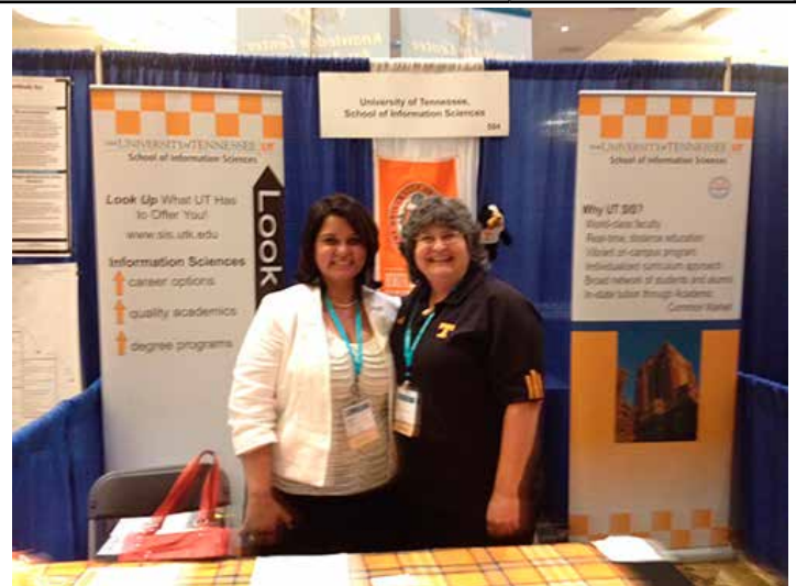
Society of American Archivists