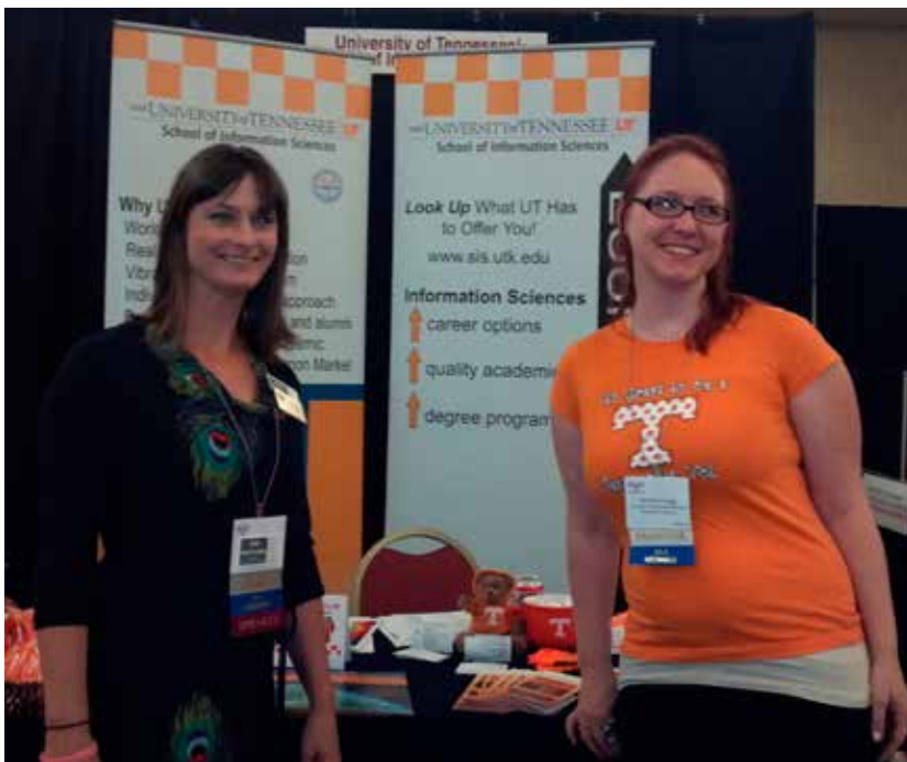
Arkansas Library Association