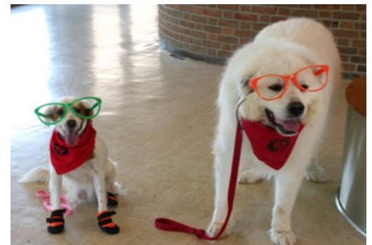
Dog Days of Summer HABIT guests