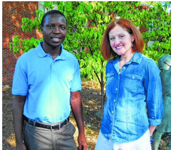
Archambault with Kamkwamba

Archambault portfolio: http://katiearchambault.weebly.com