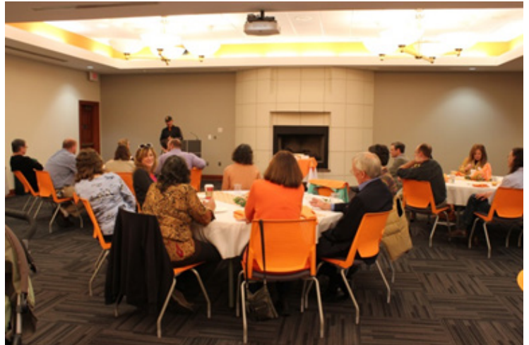
2013 Homecoming Brunch