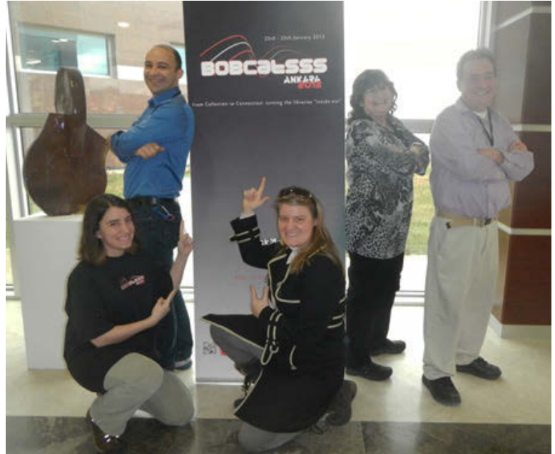
SIS Group at BOBCATSSS