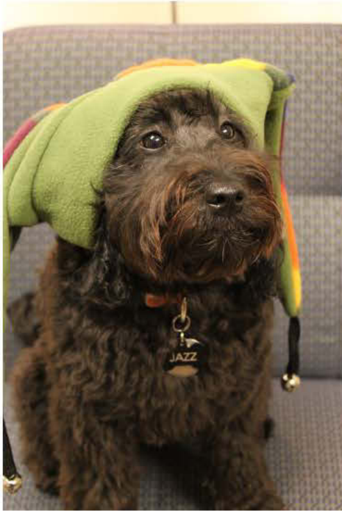
Jazz - New H.A.B.I.T volunteer