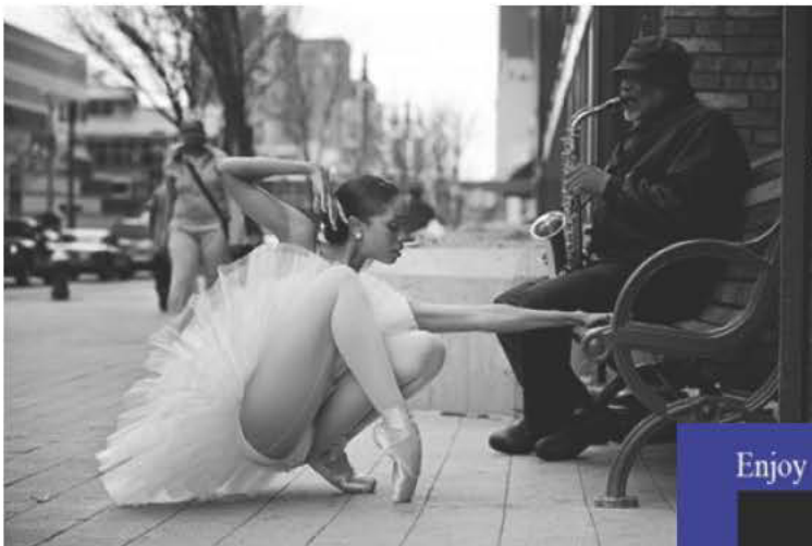
Poster: Inspiration Everywhere (left)