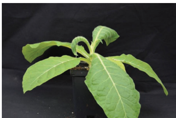
Fig. 13. Downward hooding.