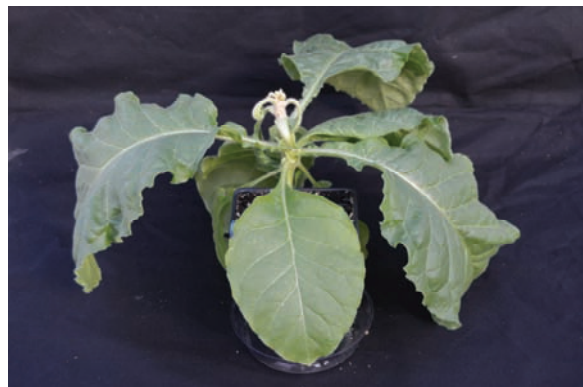
Fig. 12. Ridges in mature leaves.