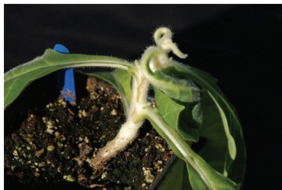
Fig. 3. Stem swelling and splitting.

Plants exposed to picloram typically exhibit symptoms relatively soon, with down-cupping of the newest leaves within one day after treatment. Older leaves tend to droop down at the petiole a few days after treatment (Fig. 1). Another common symptom is a downward cupping of leaf tips and margins, resulting in a “cobra head” appearance (Fig. 2). Additionally, plants typically have swollen stems as well as splits or brown lesions developing a week to 10 days after treatment (Fig. 3). Petioles of new leaves also tend to roll over, having a pigtail shape (Fig. 4). Slightly older leaves will have a twisted shape (Fig. 5). At higher rates, the meristem is aborted and turns white around 10 days after treatment (Fig. 6). Because picloram use rates are higher than aminocyclopyrachlor or aminopyralid, drift damage to tobacco will often appear more rapidly and more pronounced.