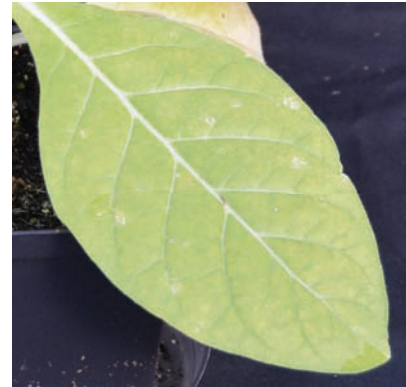
Fig. 11. Interveinal chlorosis.