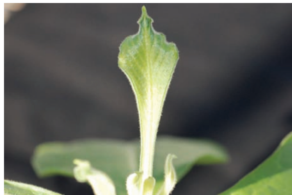
Fig. 10. Spade-shaped new leaves.