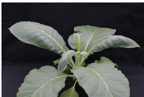
Fig. 25. Hooding and curling from leaf base.