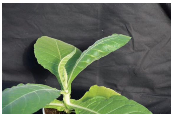
Fig. 19. Hooding and inversion.