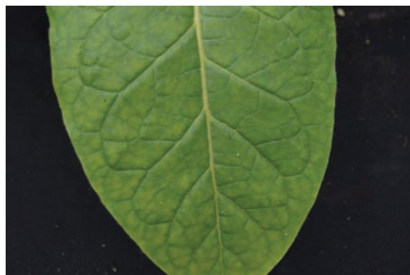
Fig. 28. Interveinal chlorosis.