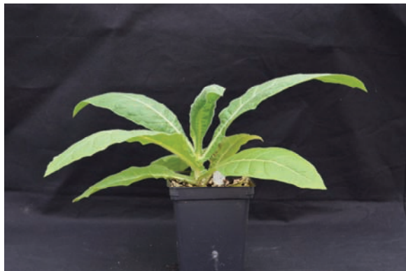
Fig. 7. Hooding and curling of young leaves.