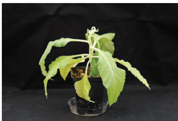
Fig. 1. Leaves drooping at petioles.