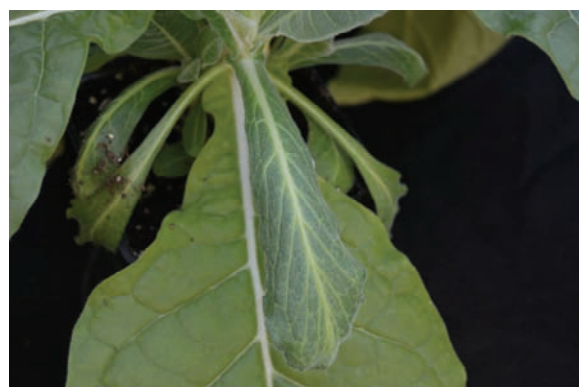
Fig. 24. Leathery leaves from stalk.