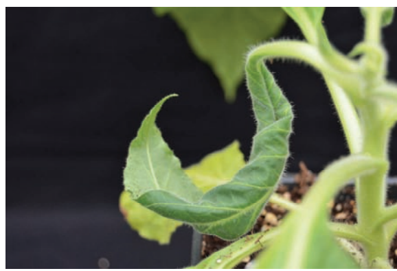
Fig. 5. Leaf twisting.