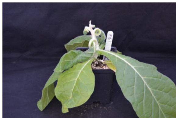
Fig. 6. Abortion of apical meristem.