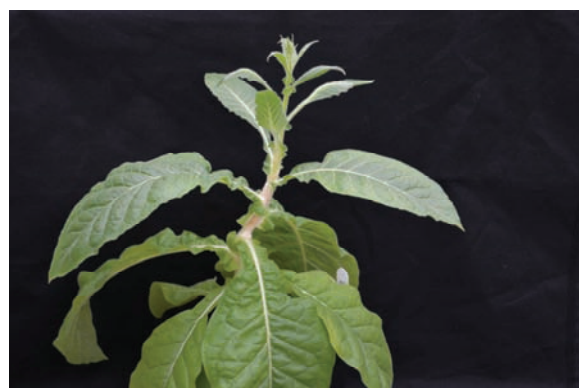
Fig. 23. Wrinkled older leaves, elongated stalk.