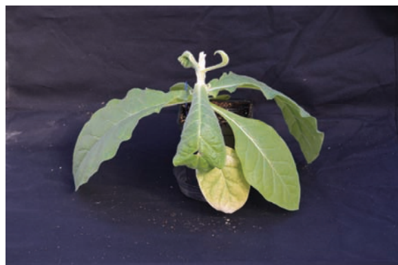
Fig. 18. Meristem abortion and leaf chlorosis.