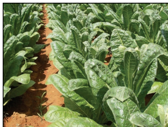
Diagnosing herbicide injury to tobacco in the field can be difficult.

Necrosis — Browning of tissue resulting from cell death.