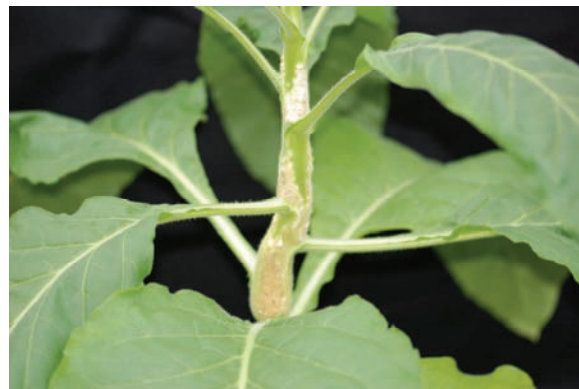
Fig. 22. Necrotic lesions on stalk.