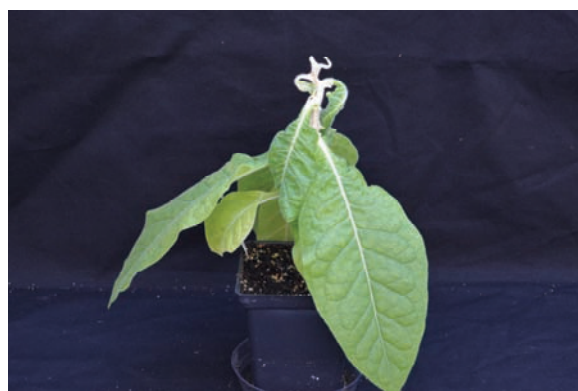
Fig. 29. Meristem abortion and drooping leaves.