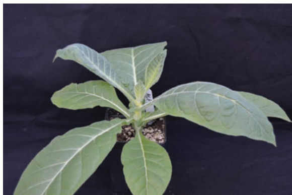
Fig. 8. More severe hooding and curling.