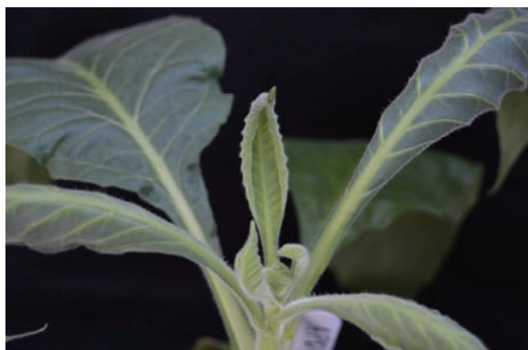
Fig. 14. Up-cupping of new leaves.