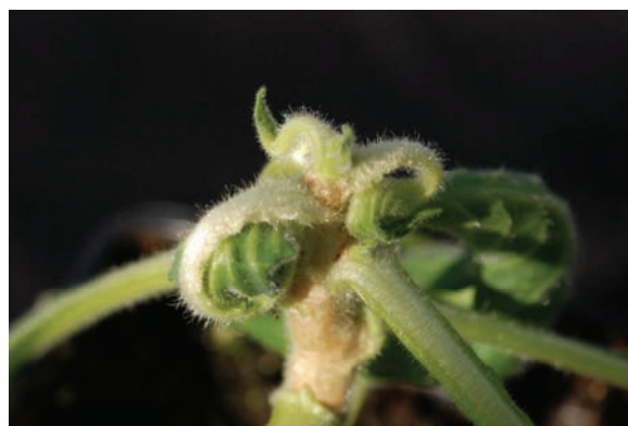
Fig. 4. Rolling of petiole and leaf.