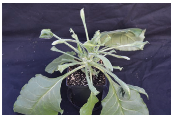
Fig. 17. Thick and strappy leaves from stem.