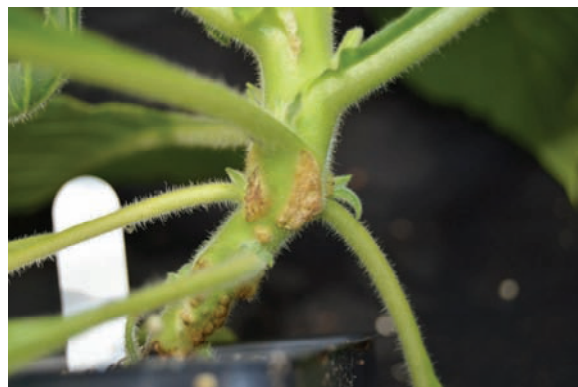
Fig. 27. Lesions near base of stem.

Overall, symptoms develop quickly in dicamba-treated plants, similar to picloram. Initially, youngest leaves exhibit hooding and curling from the base (Fig. 25). Around 10 days after treatment, newer leaves are severely hooded and curled underneath all the way down the petiole (Fig. 26). Veins are also prominent and raised. Lower rates can cause some stem swelling and elongation. Around two weeks after exposure, stems develop lesions near the base (Fig. 27) and leaves develop interveinal chlorosis beginning from margins (Fig. 28). Drooping of older leaves is very apparent at three weeks after treatment. The apical meristem is aborted, bud leaves are nearly white, and necrotic lesions have formed near the top of the main stem (Figs. 29 and 30).