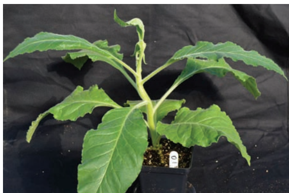
Fig. 20. Stalk elongation and curvature.