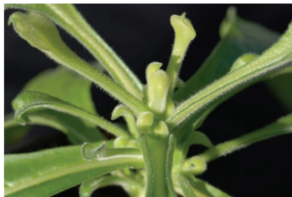
Fig. 16. Clustering of bud leaves.