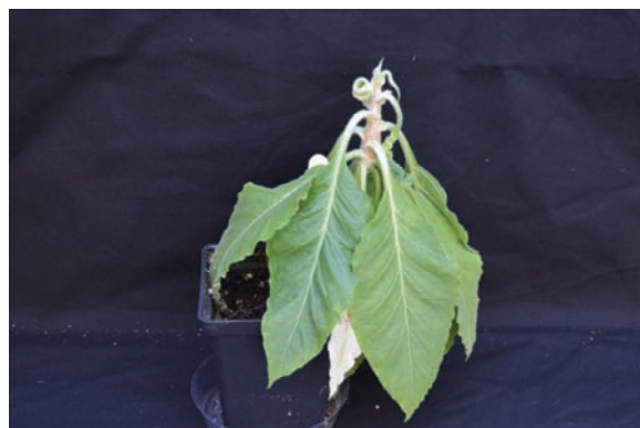
Fig. 30. Necrosis near top of stalk.