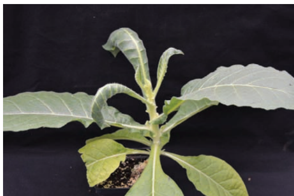
Fig. 26. Severe curling and prominent veins.