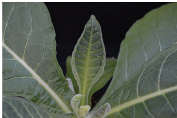
Fig. 9. Up-cupping of new leaves.

Plants treated with aminocyclopyrachlor and aminopyralid display similar symptoms. Within three days after treatment, the youngest leaves curl downward along the leaf margin (Fig. 7). Around 10 days after exposure to aminocyclopyrachlor, those same leaves maintain their hooded shape, but new leaves formed after treatment are often cupped upwards (Figs. 8 and 9). Later, new leaves have reduced lateral expansion and are often spade-shaped (Fig. 10). Interveinal chlorosis is apparent in older leaves three to four weeks after treatment (Fig. 11). Abortion of the apical meristem and development of necrotic symptoms, such as stem splitting and brown lesions, are slower than with picloram. At higher rates, petioles of young leaves can pigtail, although not as common as with picloram. Older leaves often have prominent ridges and wavy leaf margins (Fig. 12).