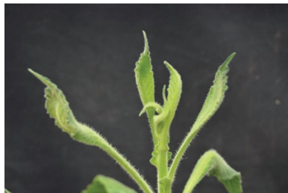
Fig. 21. Points and serrated edges on new leaves.

Symptoms begin to appear sooner with 2,4-D than with aminocyclopyrachlor, but not as soon as picloram and dicamba. The first symptoms to appear with 2,4-D-treated plants are hooding of middle-aged leaves and an inversion of new leaves (Fig. 19). The new leaves are often folded up and over, exposing the underside of the leaf. Around t10 days after treatment, plants tend to exhibit more stalk elongation and curvature, resembling a zigzag shape (Fig. 20). Stems are also swollen a few inches above the soil surface. At two weeks after treatment, new leaves may have serrated edges and a thin needlelike projection at the end (Fig. 21). At higher rates, lesions appear on a good portion of the main stem at three weeks after exposure (Fig. 22). Within a month, older leaves are wrinkled (Fig. 23) and younger leaves from the stem resemble a piece of worn leather (Fig. 24).