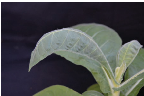
Fig. 2. Hooding.