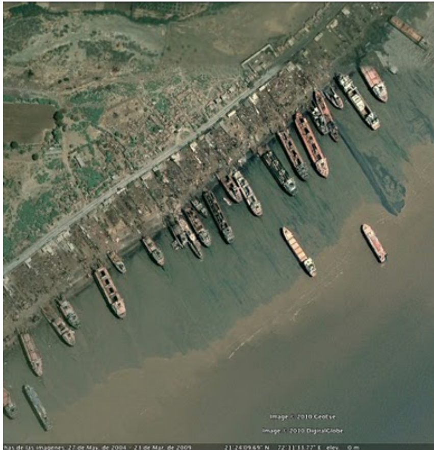
Figure 3. Ship Breaking Yard in Alang, India