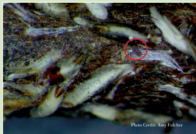
Figure 3. Japanese maple scale crawler.