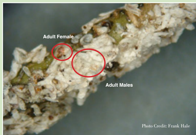
Figure 4. White peach scale can resemble Japanese maple scale. White peach scale is characterized by a “fried egg” appearance of individual adult females and a fluffy appearance created by a dense infestation of males.