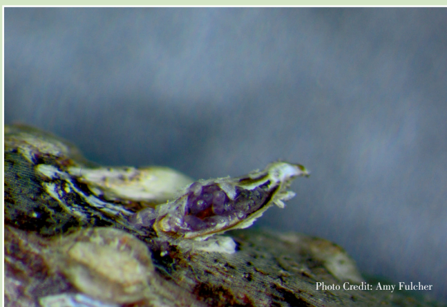
Figure 2. Japanese maple scale eggs beneath the adult female.