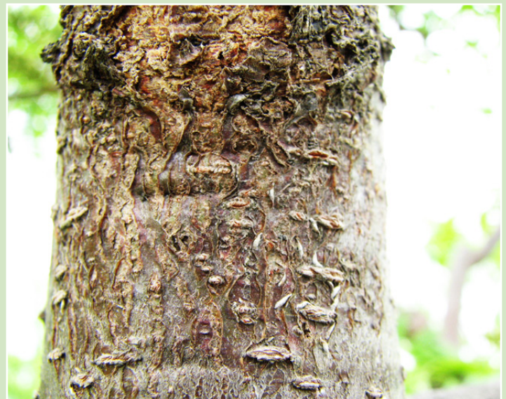
Figure 6. Small JMS populations can be difficult to detect.

To monitor for egg development, a dissecting scope is often necessary. A hand lens may not offer sufficient magnification to readily detect eggs. A small sticky trap can be made by wrapping a JMS-infested branch with double-sided tape or by coating regular clear, tan or white tape with a very thin layer of petroleum jelly. Use flagging tape to mark the branch and check the sticky traps for the purple crawlers several times a