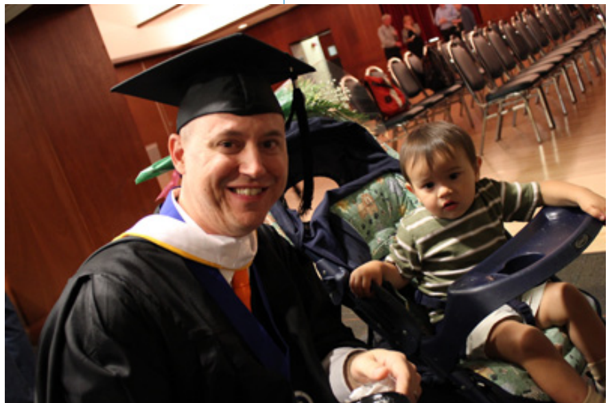
The next generation of UTK SIS graduates looks on at the 2011 Hooding Ceremony

Thank you for all your encouragement in my course work at UT. You gave me the confidence to complete my M.S. and pursue a doctorate