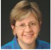
Mary Alice Ball