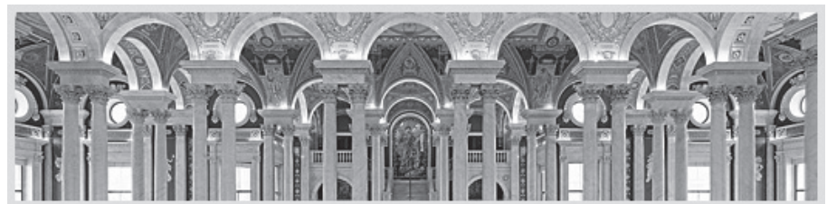
The Library of Congress will be one of the Federal Libraries

This summer a new course will be offered on Federal Libraries. Students will visit a variety of federal libraries in