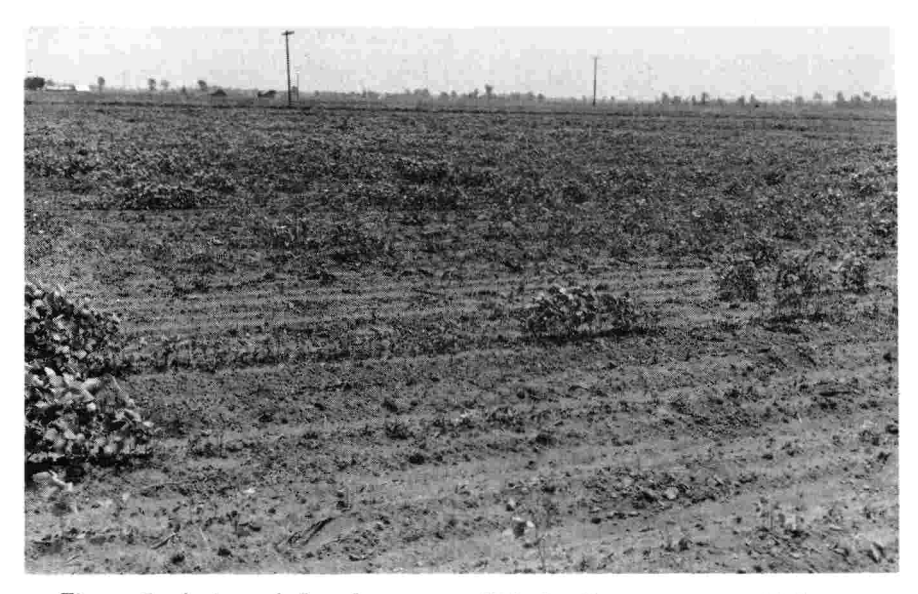
Figure 1. A view of the plot area at Ridgely, Tennessee, on which most of the tests were conducted. Note severe damage to susceptible plants caused by the soybean cyst nematode.

Dyer produced an average of 12.1 bushels more per acre than Hill in these tests. Calculated at $2.80 per bushel, this amounts to $33.88 more per acre per year for the Dyer variety.