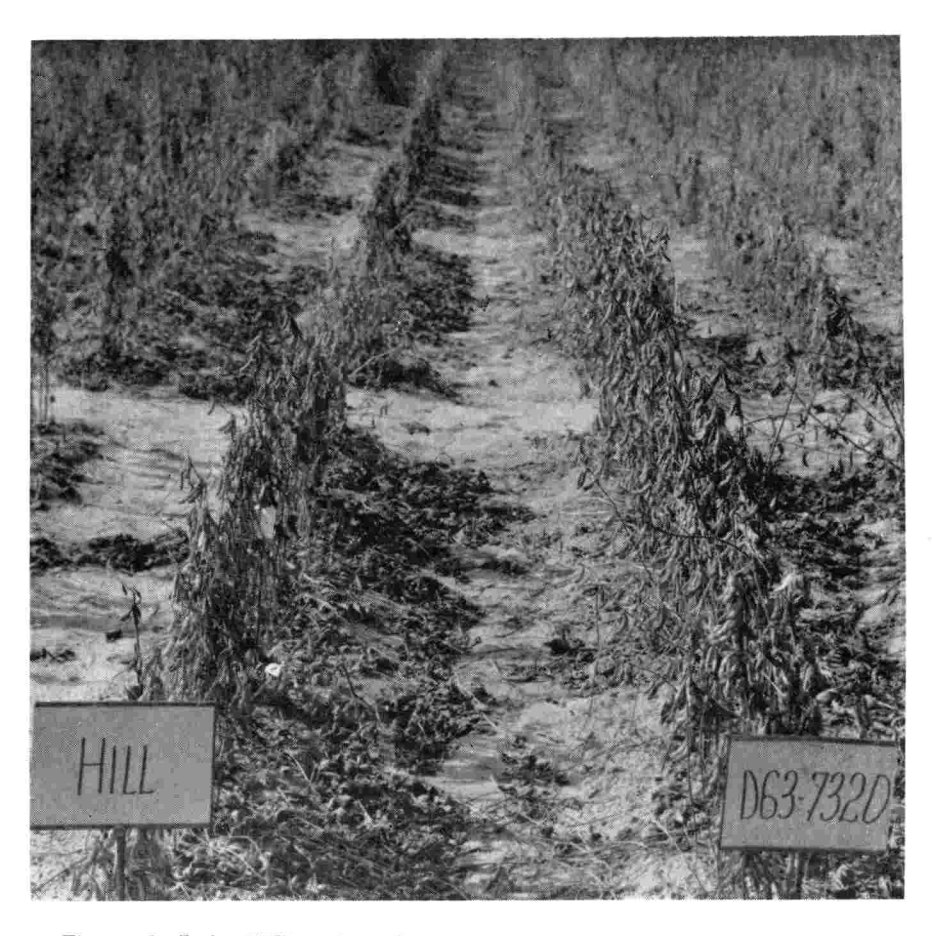
Figure 3. Left: Hill variety showing much less growth due to a heavy infestation of cyst nematodes on the roots. Right: A row of Dyer (D63-7320) showing vigorous growth in soil heavily-infested with the soybean cyst nematode.