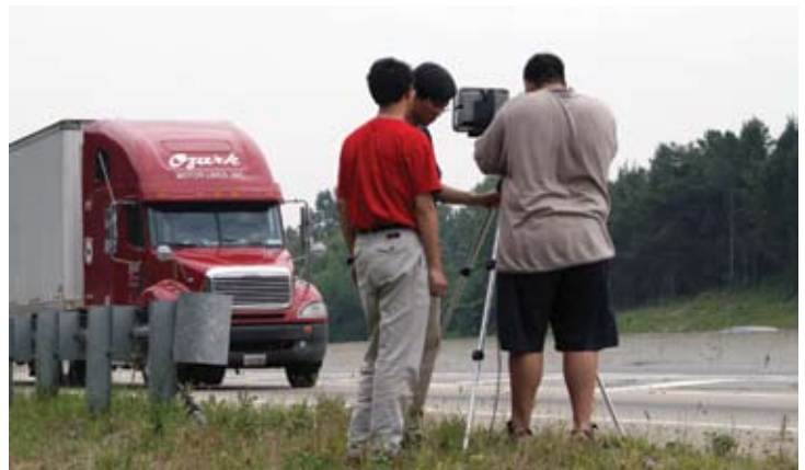
Students collect license plate data for a research project involving automated speed enforcement.

Dr. Urbanik and Dr. Elhanany are conducting research at the National Transportation Center on a NTRCI-funded project for controlling vehicular traffic flows in complex transportation settings. The work utilizes a novel approach for scheduling vehicles across a network of intersections. By employing graph theory and systems control techniques, as commonly used in the area of high-speed communication networks, this work aims to deliver a robust and scalable framework for next-generation transportation infrastructure that can adapt the control decisions to reflect the characteristics of vehicles with a focus on trucks.