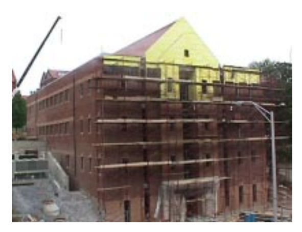
Excavation for Burchfiel Geography Building 10/23/98