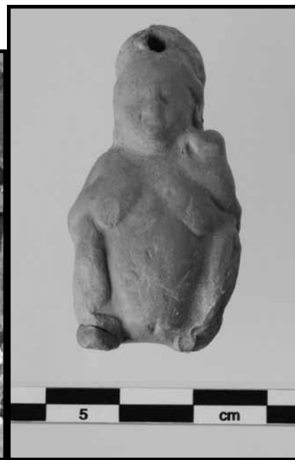
Clay figurine pendant of parturient female, possibly coming from Egypt. It was found in a mixed context in the central-eastern area of the site.

These provide breakthrough information of how this emerging elite changed its society and manifested its power.