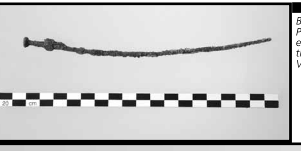
Bronze pin with globe from Late Protogeometric grave 62 in the northwest excavation sector. Pins such as this held the clothing together at the shoulders. (R. Vvkukal)