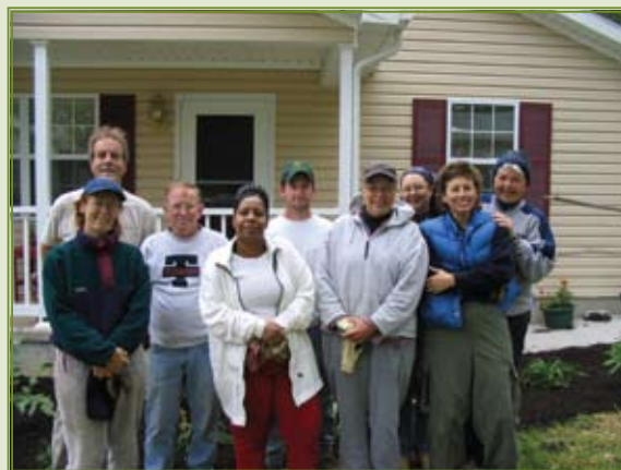
Master Gardeners, community volunteer gardeners and new homeowners celebrate the completion of installing a landscape. This is a typical occurrence for a Saturday afternoon during the spring and the fall.

Following the year of certification, Master Gardeners must maintain their certification with 25 hours of volunteer service and eight hours of continued education. A Master Gardener volunteer is a truly dedicated individual.