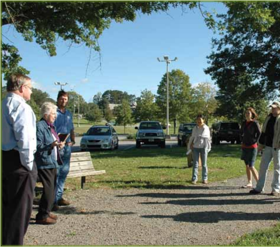
MLA Students participate in a regional service learning project.