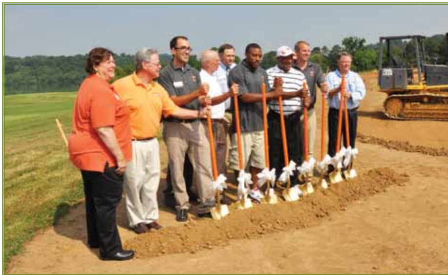
Members of UT and AstroTurf break ground at the new Center for Athletic Field Safety.

The geographic location of the site will enable scientists to conduct research on a variety of surfaces from both cool- and warm-season climates. The unique outdoor research facility will comprise