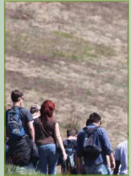
Students on their High County Cabin design charette.

on social issues and snowball fights combine with much laughter to create a unique experience for all — one that will be carried on and cherished for many years to come. 🌿