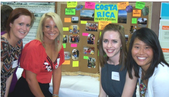
Students with posters at The Exhibition of Undergraduate Research and Creative Achievement in March, 2012.

ELECTRONIC VERSION OF RESEARCH NEWSLETTER CAN BE FOUND: