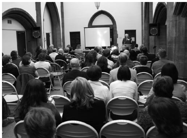
Some 75 alumni and friends gathered at UT Hoskins Library to enjoy the 2009 SIS Alumni & Friends Day.