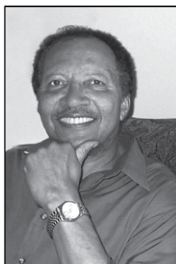
Walter Dean Myers presented the 2009 Arbuthnot Lecture.