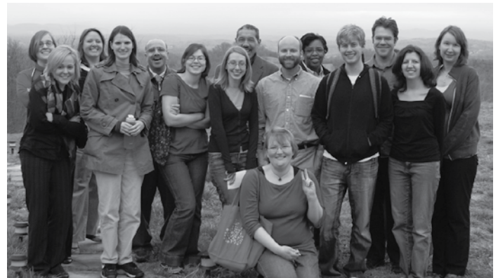
Three faculty members and 16 SIS students visited the Highlander Center.