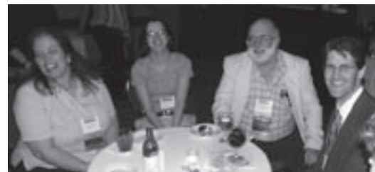
SIS alumni and students enjoy an easy moment at the SIS alumni & friends reception at TLA this year.