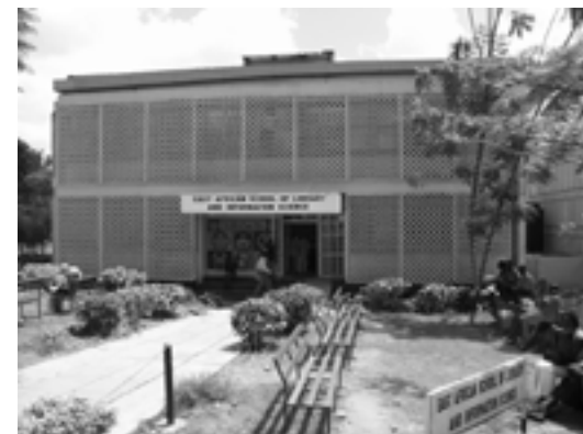
East African School of Library & Information Science