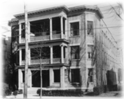
A photo of SIS' original home, Temple Court, as it originally appeared with balconies.

Today, graduate teaching students from the College of Business occupy the 3 rd floor, while the Medieval and Renaissance Curriculum and Outreach Project (MARCO) occupies the 2 nd floor. The Center for Business and Economic Research is moving to the 1 st floor this summer. Renovations include rebuilding the fire escape, rewiring the building, and putting new locks on the doors.