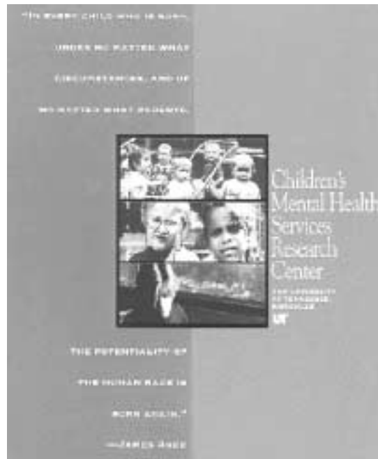
For more information about the Children's Mental Health Services Research Center, visit the Center's website at http://social33.csw.utk.edu/

The Center recently assisted two junior UTK College of