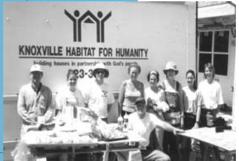
Members of the MSSW Social Work Organization worked with Habitat for Humanity to help build a home for a low-income family.